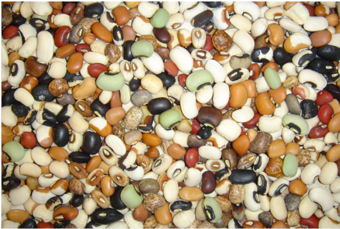
Figure 1. Diversity of seed types in cowpea.

Cowpea ( Vigna unguiculata ), an ancient crop originated in Africa, is well known for its adaptation to drought, heat, and poor soils. Although most cowpeas grown in the U.S. are black-eyed peas, great diversity of seed colors and patterns exists within cowpea (Figure 1). Cowpea varieties