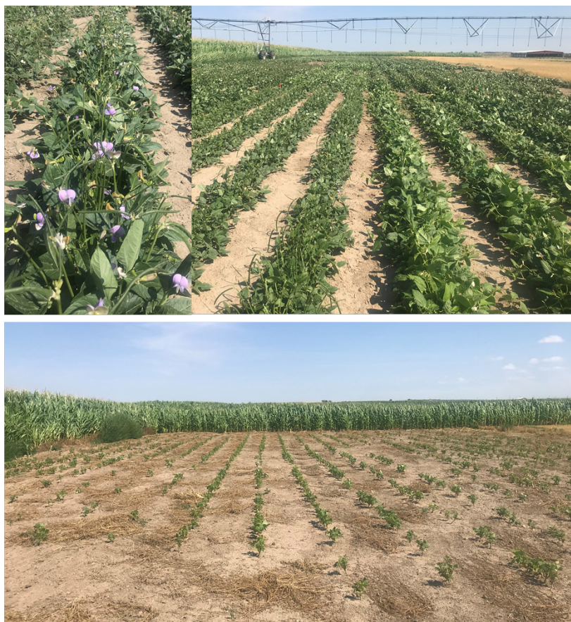
Figure 2. Cowpeas (top) and common beans (bottom) growing in Akron on August 3, 2020

In summary, due to its resilience and versatility cowpea shows promise as a great alternative crop for improving the profitability of Colorado cropping systems as well as soil and human health.